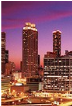
Part of the Downtown Atlanta Skyline

You've heard the news, home sales are down. Remember, that real estate is a micro entity. What happens in Atlanta is quite different than what is going on Florida,